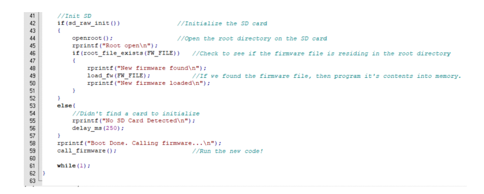
Figure 4: main.c (Contd.)